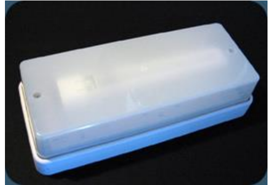
Flat diffuser. White skirt.