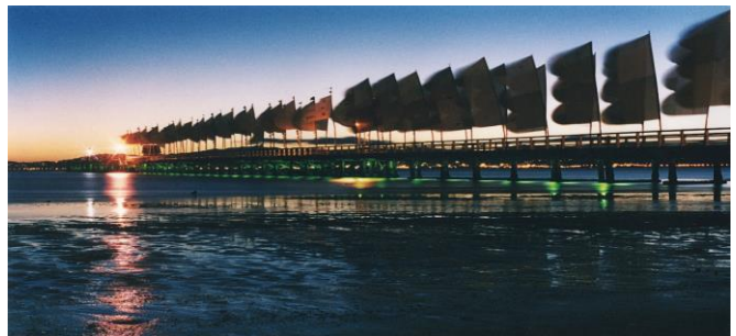
Petone Wharf NZ, PBHPL18 c/w green diffuser. Installed 2002, still operating 8 hours 7 days in 2016.