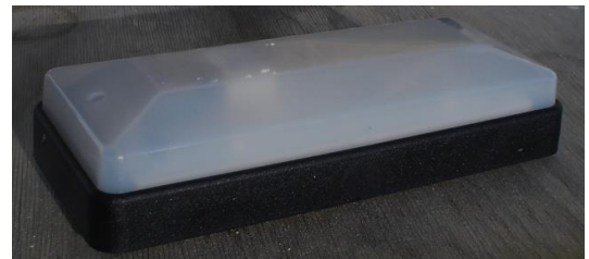
Diamond diffuser, black skirt.